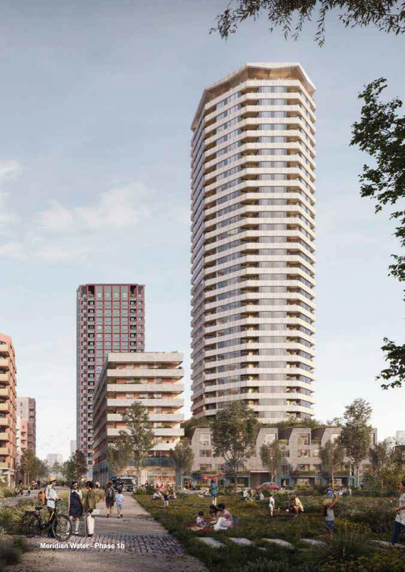
Meridian Water - Phase 1b