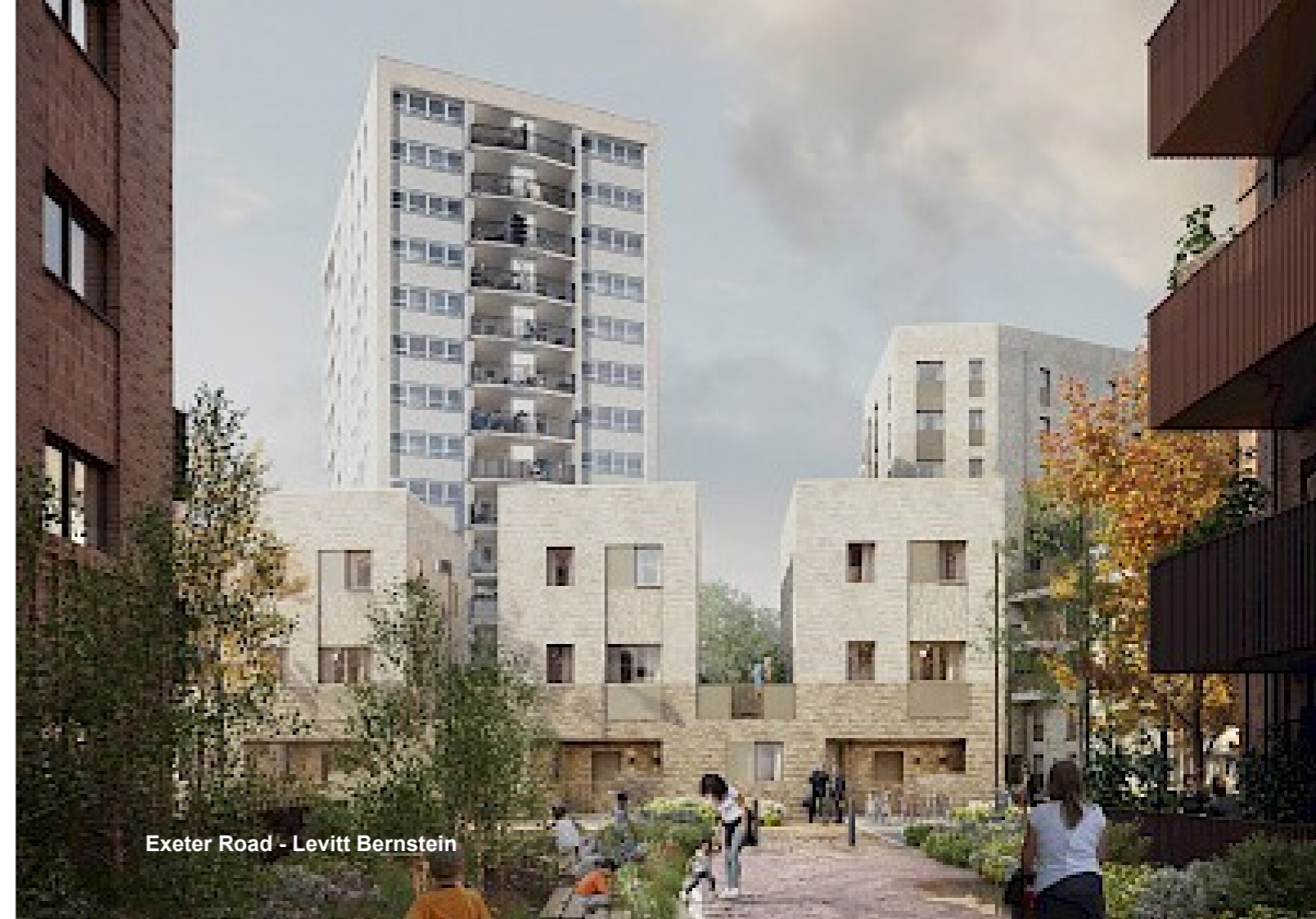
Exeter Road - Levitt Bernstein

Note. All images are reproduced from publicly available documents and show schemes reviewed by the panel which have been given “resolution to grant” by the planning committee.