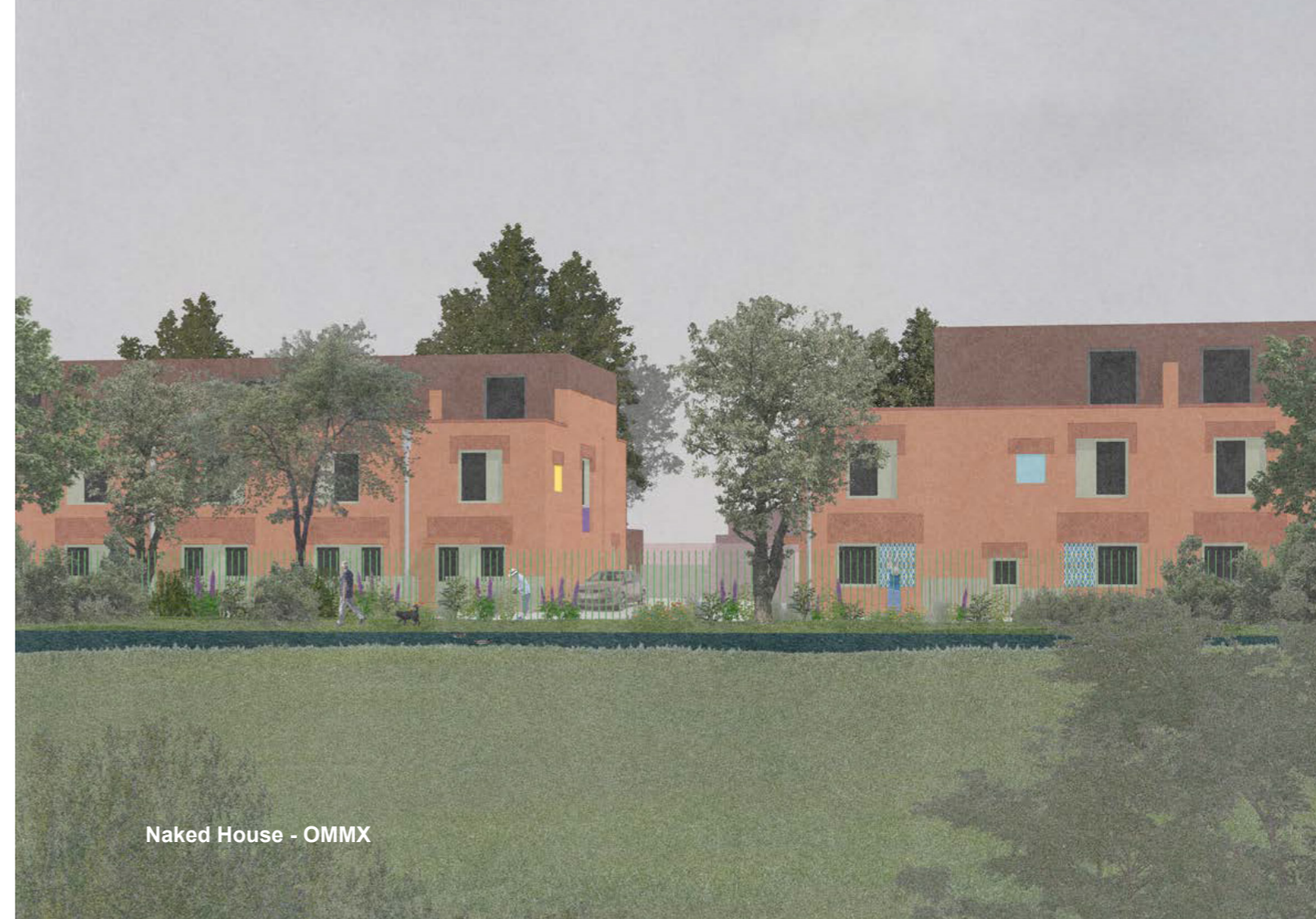
Naked House - OMMX