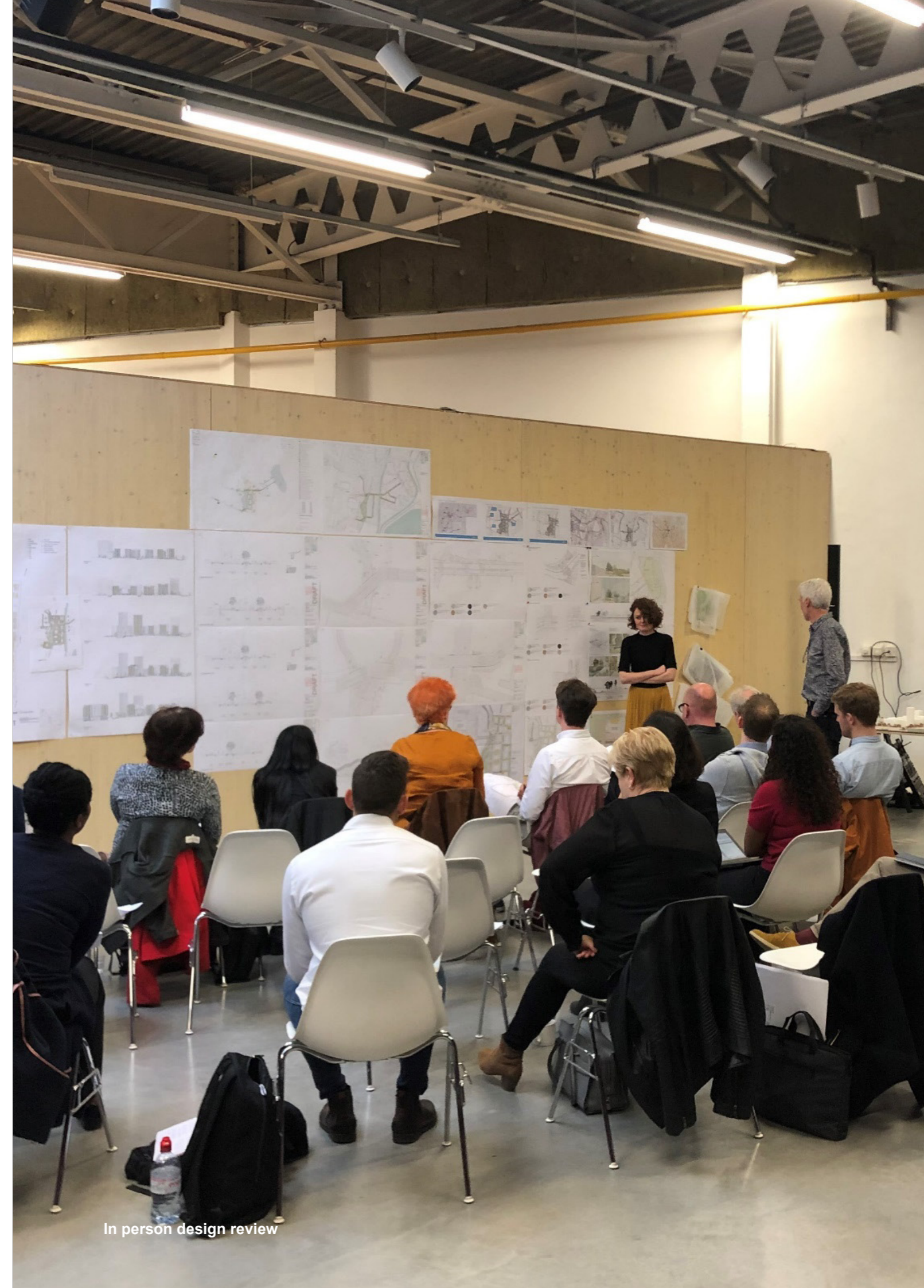
In person design review

10:00 Login (5 mins) 10:05 Introductions led by chair (5 mins) 10:10 Design team presentation (25 mins) 10:35 Clarification Questions (15 mins) 10:50 Panel Discussion (25 mins) 11:15 Chair's summary (5 mins) 11:20 Finish