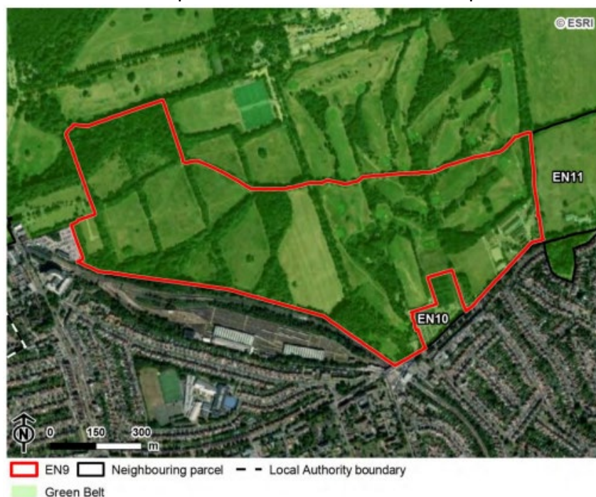
Figure 2: Green Belt parcel EN9.

However, we suggest that the evidence base behind the Green Belt could be improved and therefore strengthen the relevant policies in the draft Local Plan. The Council have published a Green Belt and MOL Assessment as part of the evidence base underpinning the Local Plan. Appendix B is the Green Belt Harm Proformas for the parcels of land that were assessed as part of the study. This included the land parcel labelled EN9, shown in the figure below, which contains the site at Trent Park Equestrian Centre within a wider plot of land.