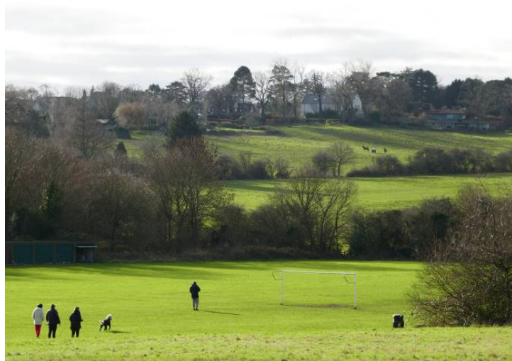
View across the Hadley Wood Association Open Space to the threatened fields in SA45

All the land west of the railway should remain in the Green Belt in conformity with London's National Park City map. This would be compliant with Policy PL8 para 3.8.7. and the Blue and Green Strategy.